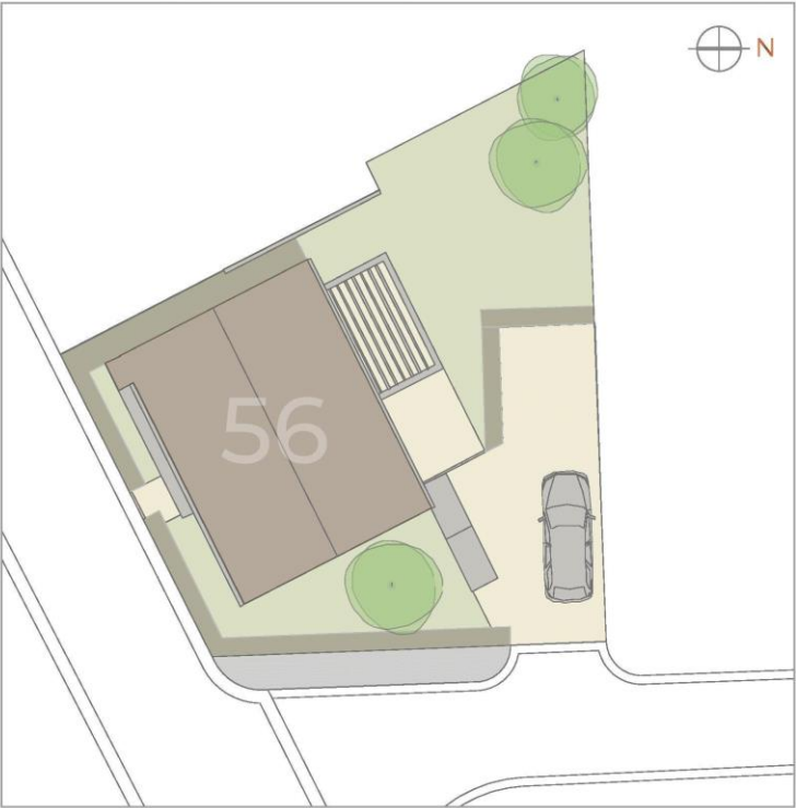
Plot 292 sq m